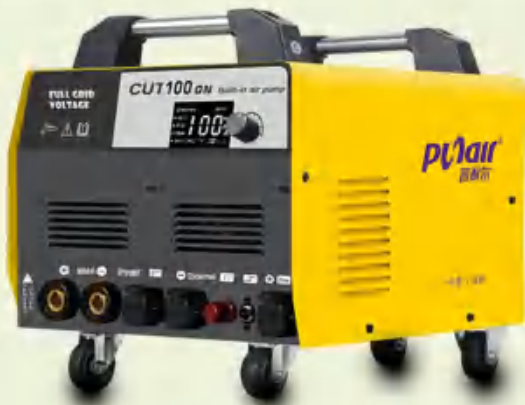
CUT 100 N 1Phase 220V

The set of Plasma CUT machines adopts the advanced MCU and IGBT technology. And it has Optional air supply with Build-in air pump or external air source, and with a user friendly operation LED panel, adjustable 2T/4T, and post gas function.