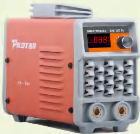
ARC 250SV 220/380V