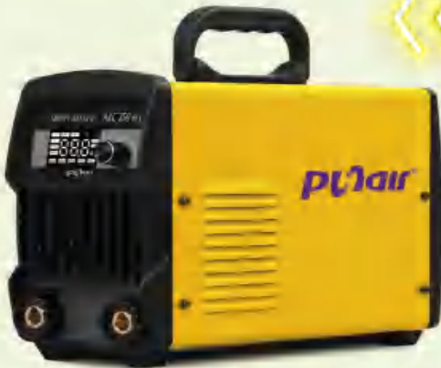
ARC250D MAX 150-510V