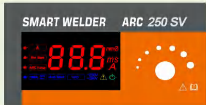
1 Phase 140A 2 Phase 160A

Punair's new model-smart welder ARC 250SV is a compact and portable welding machine in the pocket size. Based on the MCU and IGBT technology and friendly LED operation panel, it is very suitable for the MMA welding operation with 2.5mm and 3.2mm electrodes under dural voltages. Indeed, this is a good helper for both home and industrial using fields.