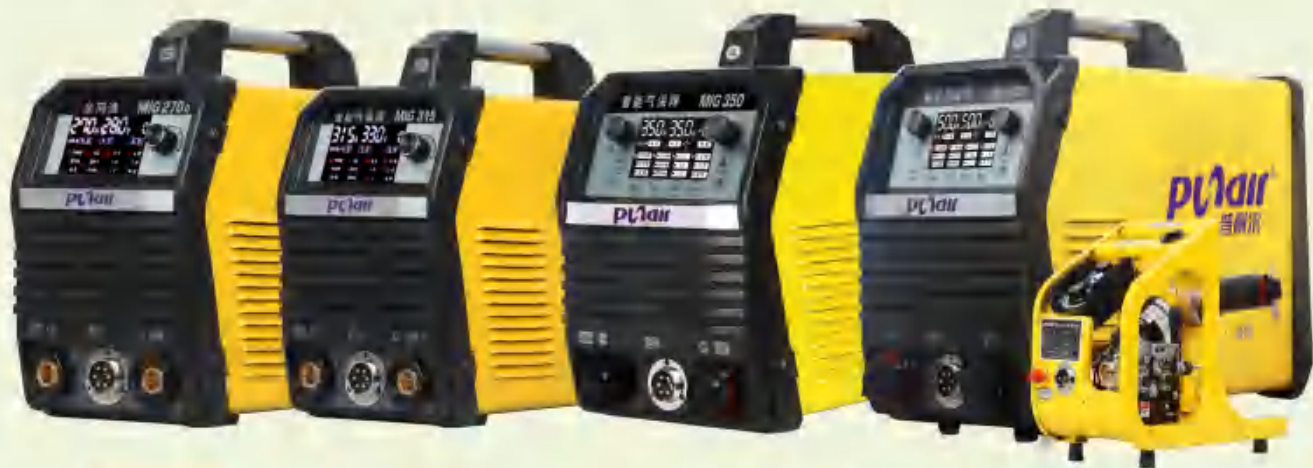
MIG 500 3P/380